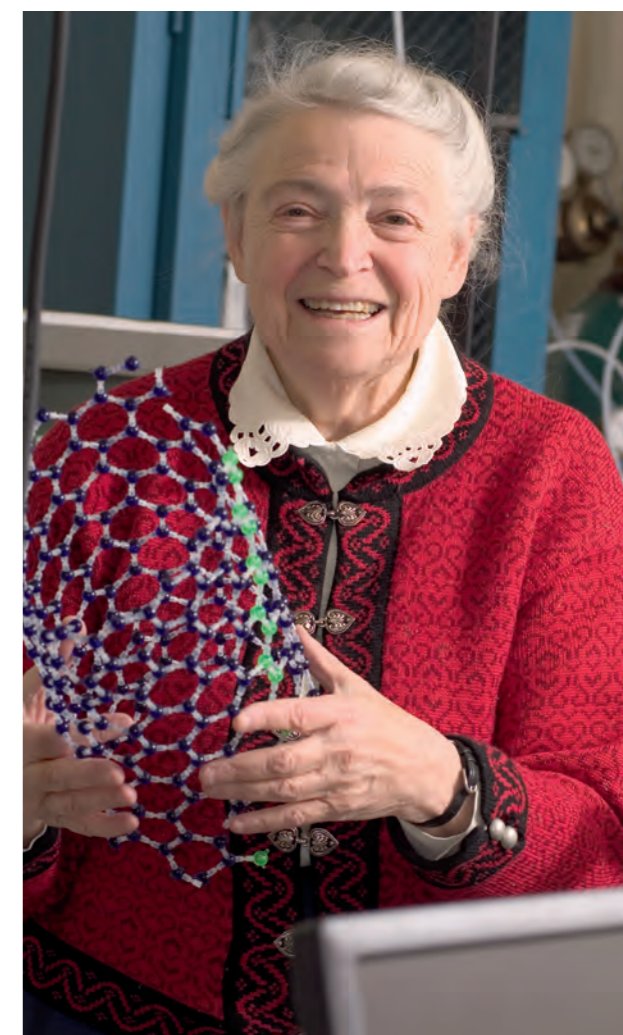
Prof. Mildred Dresselhaus started her career as a faculty member at MIT as the Abby Rockefeller Mauzé Professor in 1967, funded by a female member of the Rockefeller family

When I started my independent career at MIT in the 1960s, women undergraduate students at MIT made up only four percent of the entering class, compared to about 50 percent nowadays. I have for a long time worked hard to increase the participation of women students' careers in physics. Fellowships for women have been and remain helpful in encouraging women to persist in their careers in physics, and I personally have spent much time in running seminars to promote this cause. Women do