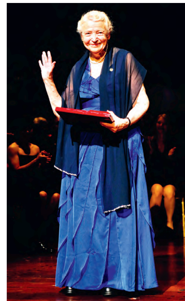
Prof. Mildred Dresselhaus has been awarded 36 honorary doctorates, the Fermi Award, and the Presidential Medal of Freedom – among others

The scientist, who has been called the “Queen of Carbon”, has received numerous awards for her research. On top of her scientific success Mildred Dressel-